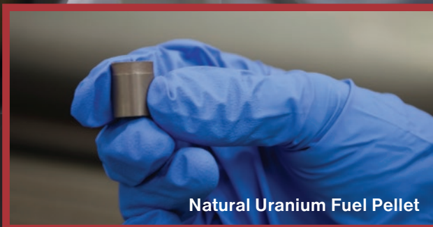
Natural Uranium Fuel Pellet

BWXT is a leading provider of CANDU® fuel and operates dedicated fuel fabrication facilities that are licensed by the Canadian Nuclear Safety Commission. Utilizing state-of-the-art automated manufacturing and inspection technology, BWXT offers the optimum product quality, traceability and responsiveness demanded by our nuclear customers.