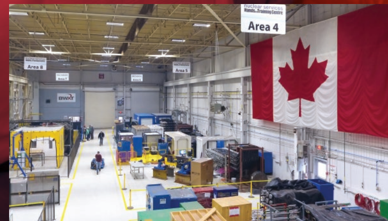
BWXT's Hands-On Training Centre