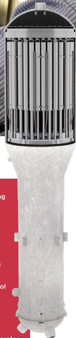
CANDU® Steam Generator