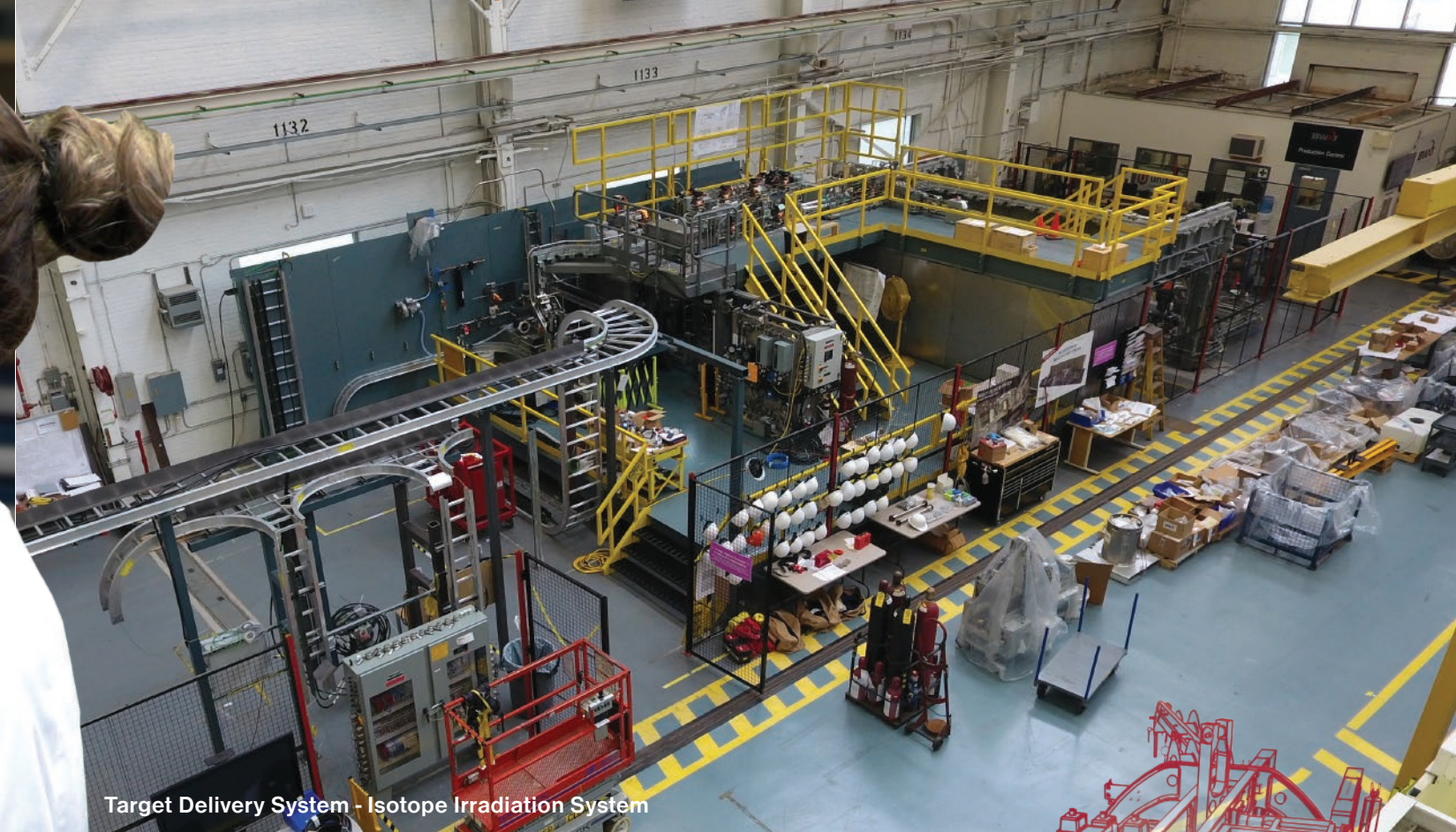
Target Delivery System - Isotope Irradiation System