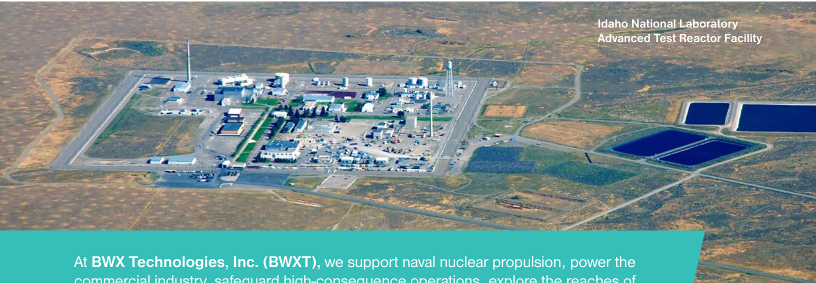
Idaho National Laboratory Advanced Test Reactor Facility

At BWXT Technologies, Inc. (BWXT) , we support naval nuclear propulsion, power the commercial industry, safeguard high-consequence operations, explore the reaches of space and develop life-saving technologies. We are People Strong, Innovation Driven .