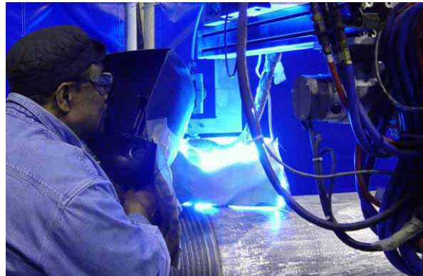
An employee welds a component at the facility in Barberton, Ohio.