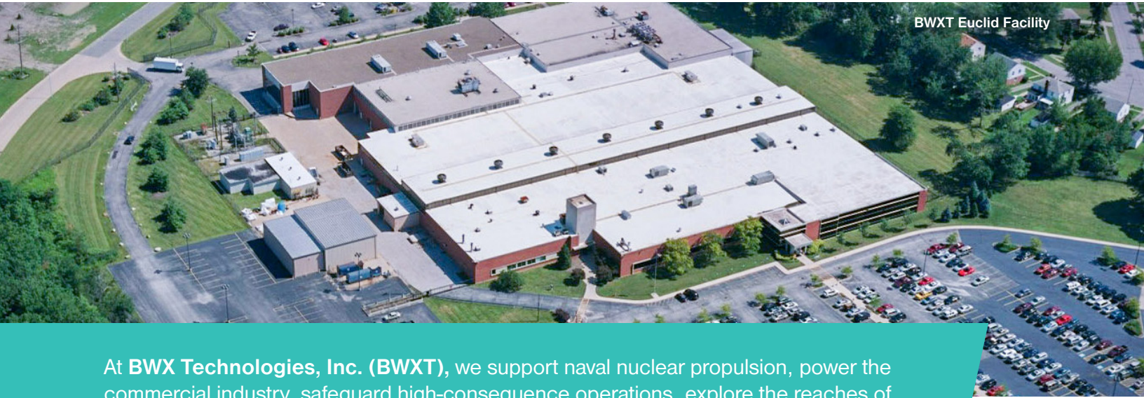
BWXT Euclid Facility

At BWXT Technologies, Inc. (BWXT) , we support naval nuclear propulsion, power the commercial industry, safeguard high-consequence operations, explore the reaches of space and develop life-saving technologies. We are People Strong, Innovation Driven.