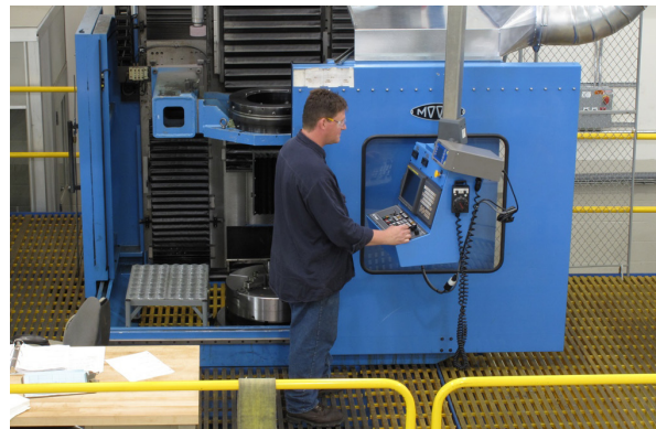
BWXT Euclid employee operating vertical grinder