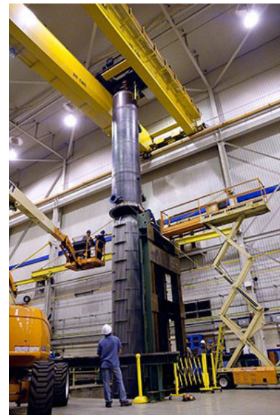
BWXT-manufactured pressure vessel