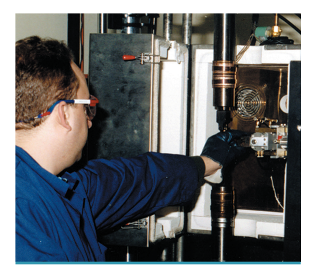
Elevated temperature tensile testing