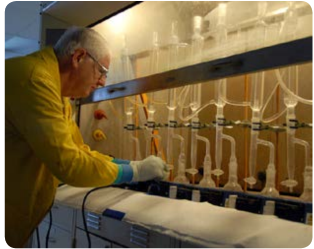
Sample preparation in radiochemistry laboratory