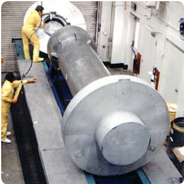
Cask handling operations

The project leader maintains overall control of the project including: schedule, cost, technical performance, and quality of work.