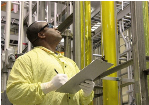
Nuclear Fuel Services, Inc. (NFS) employs approximately 960 employees