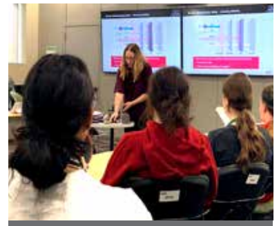
Students watching a demonstration at our facility in Peterborough.

We welcomed more than 50 grade nine Indigenous students to our Peterborough site for a presentation on the science and benefits of nuclear energy, and for a tour of our fuel fabrication facility.