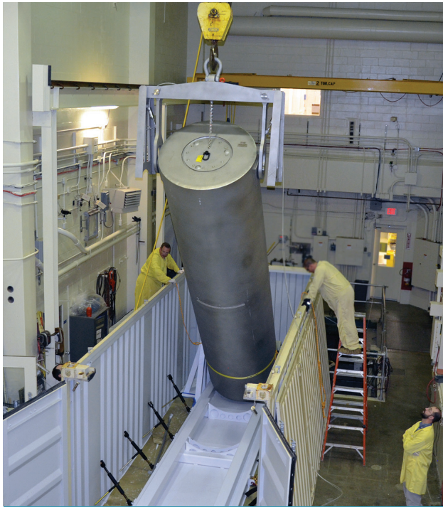
Cask and lifting fixture

Our laboratories are structured to complete critical projects such as failure investigations on a rapid turnaround basis. A Project Leader in the appropriate area of expertise is assigned for each new project and serves as the technical point of contact to the customer. The Project Leader maintains overall control of the project including: proposal preparation, schedule monitoring, costs, technical performance, and quality of work.