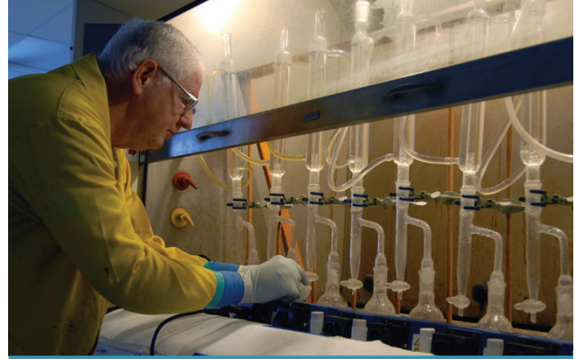
Sample preparation in radiochemistry laboratory