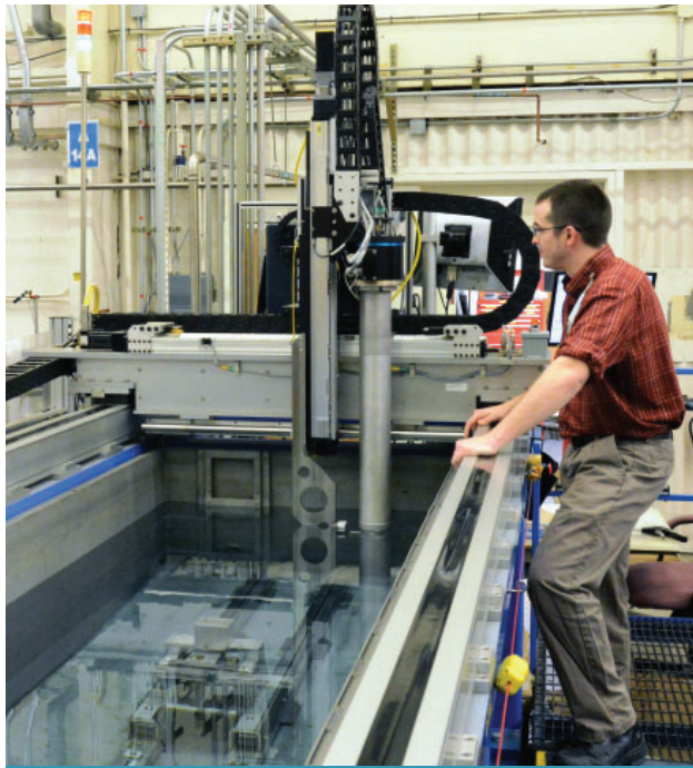
BWXT specializes in custom, turnkey ultrasonic inspection system development and manufacture