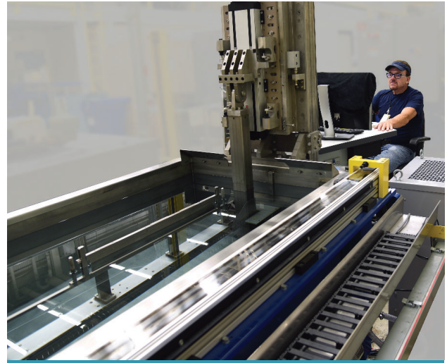
Custom ultrasonic inspection tank developed for low-enriched uranium fuel elements used in research and test reactors